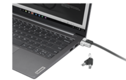
NanoSaver Cable Lock from Lenovo